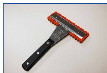
233-71AG grill wiper accessory for cleaning