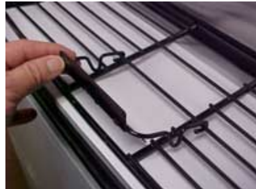
FIGURE 2. Locate on Cup Rest