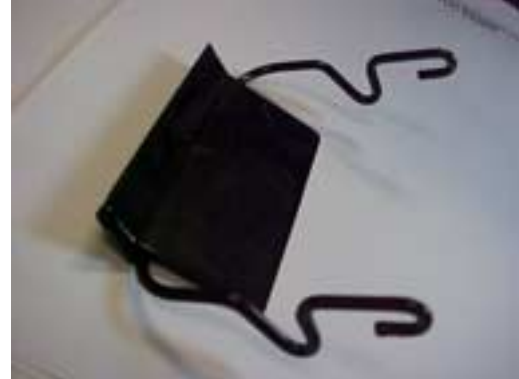
FIGURE 1. Splash Shield